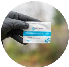
Nuclear Detection wipe