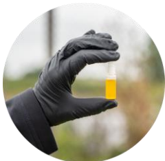
Single Use Test