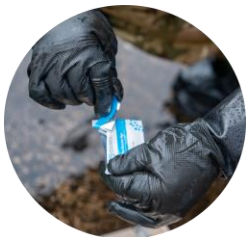
Nuclear Detection wipe